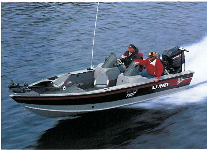
1890 Pro-V LE. The industry's state-of-the-art fishing boat.