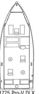
1775 Pro-V DLX