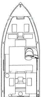
1800 Pro-V Bass